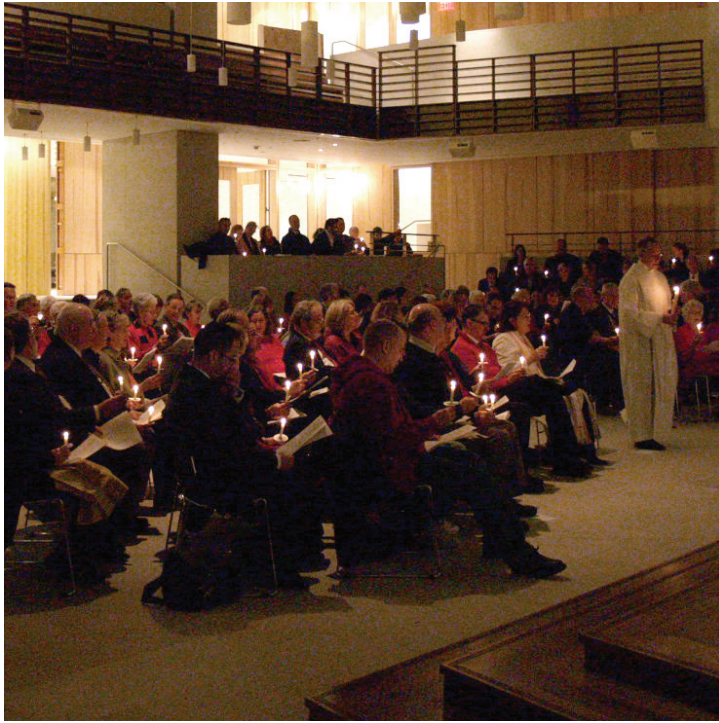
Return to 10th and G